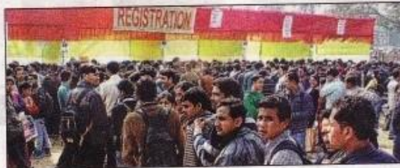
Youths queue to register at the job fair in Guwahati on Wednesday.

Altogether 15 private companies from different sectors