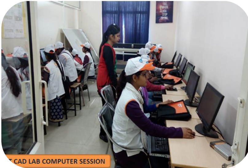
CAD LAB COMPUTER SESSION

Rural Electrification Corporation Limited (RECL) have sponsored under CSR, the training of 540 candidates belonging to SCs, STs Backward Classes, Physically