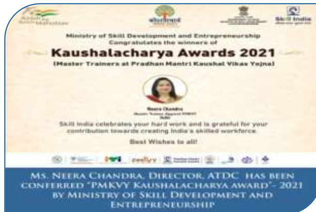
Kaushalacharya Award 2021