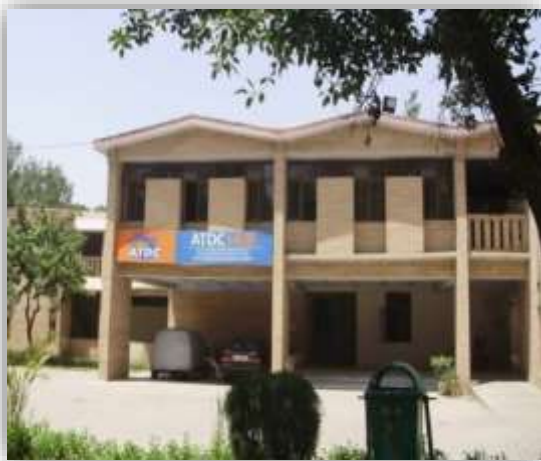
ATDC- DILSHAD GARDEN