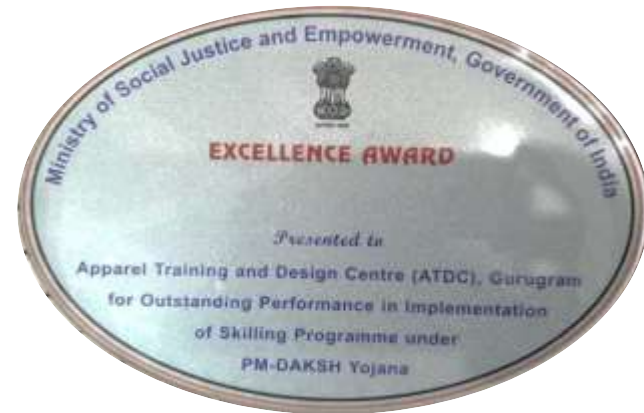
Excellence Award by Ministry of Social Justice and Empowerment 2021