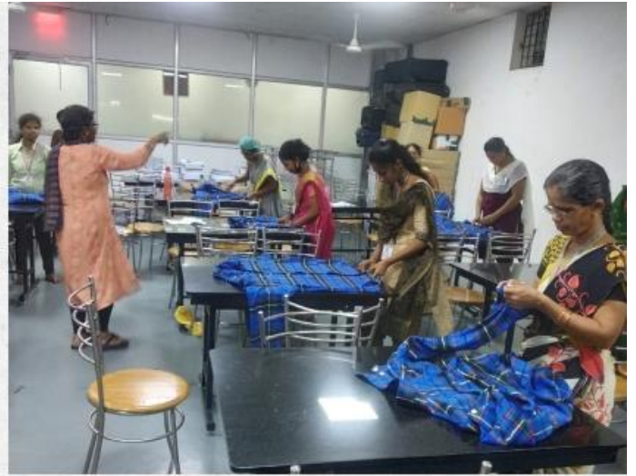
UPSKILLING OF PATTERN MASTERS IN GURUGRAM