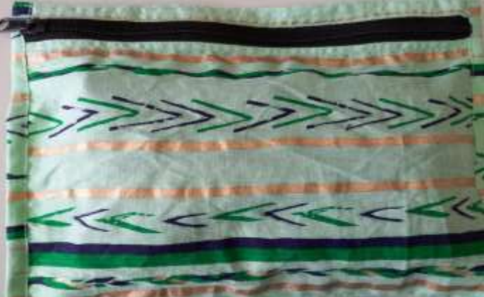
PRODUCTS MADY BY CANDIDATES