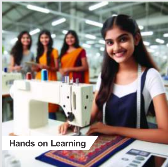
Hands on Learning