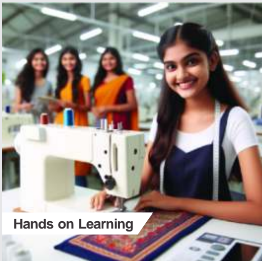
Hands on Learning